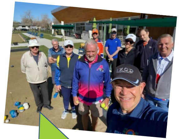
Training session at Calgary Lawn for members of the 2022 Development Squad was held May 22.

This past winter members of the Bowls Alberta Board were able to head down to Red Deer and assist in the first afternoon season of open bowling on the indoor soccer field at one of the city Recreation Centres. They were open for bowling through the spring and were pleased with the community involvement. They will pick up the program again in September. The city of Okotoks also ran a similar program and members of the Stanley Park LBC helped them get started. And later this month we have two members heading up to Grande Prairie to host a Try-It event at the former Grande Prairie LBC. The plans are to continue to support endeavors like these to increase participation across Alberta!