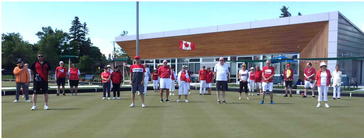
'Social Distanced' Canada Day Bowls Tournament at Calgary Lawn.

Thankfully the Covid-19 case numbers eased up in the spring and restrictions were likewise eased. Towards the end of June our clubs slowly began to open with Safety Officers in place, with restrictions on the use of their club houses, with pre-play online registrations and with the requirement of social distancing on the greens. From the clubs' point of view, the season wasn't all lost!