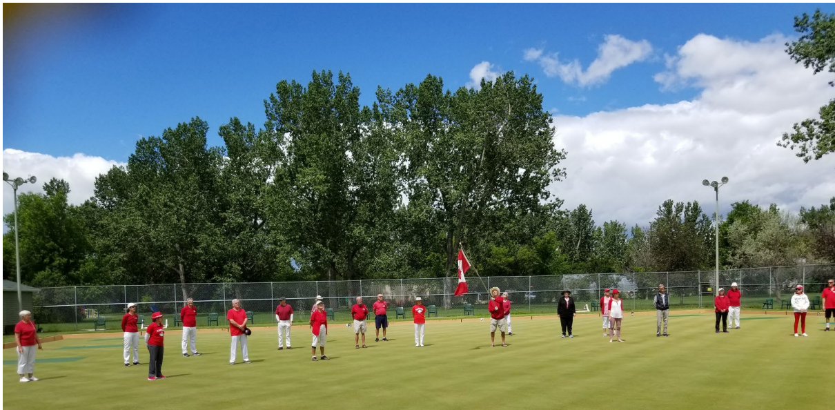
Social distancing 'O Canada' at the Stanley Park Lawn Bowling Club in Calgary

34% of the action ideas in the 2020 Plans were completed while the rest were all delayed due to the Covid-19 pandemic.