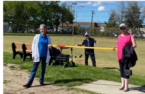
Always keeping that 2 m distance.

Our clubs went over and above many of the requirements to open safely through the pandemic. They appreciated the leadership from Bowls Alberta and except for two clubs that went off a bit on their own and didn't adhere to all the recommended protocols, but thankfully all members were kept safe at their respective clubs. They adhered to the restriction of all players participating only at one club with members only rolling bowls at their primary clubs. Of note was the exceptional volunteers that stepped up at all the clubs and put in extra hours posting information, keeping records, and continually monitoring situations.