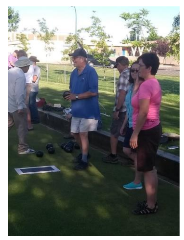
Lethbridge Coaching session