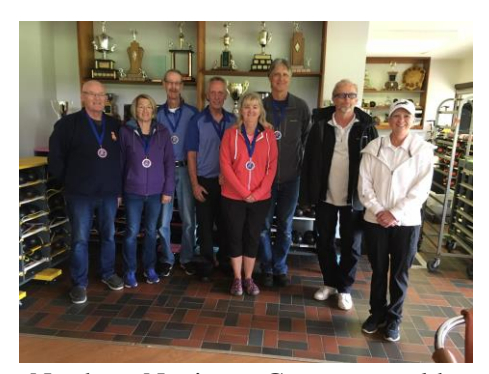
Northern Novice at Commonwealth