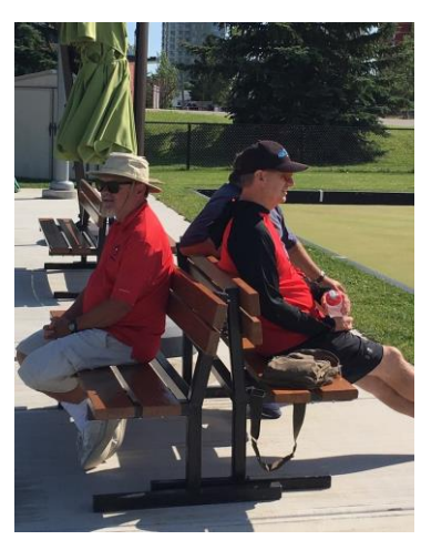
Umpires at Mixed pairs