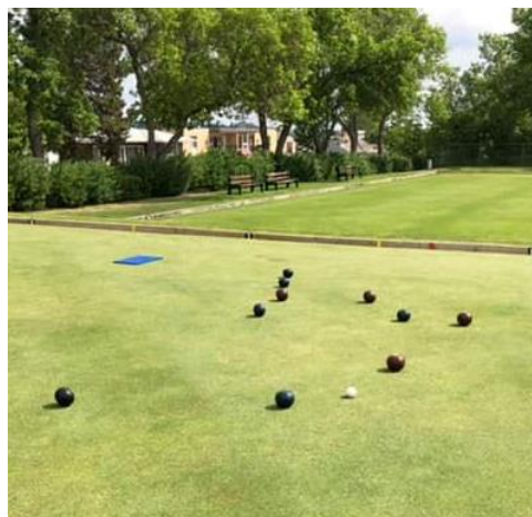
Gloomy Day in the Hat so only two visitors for the day