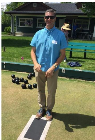
Tried it and joined Bow Valley!