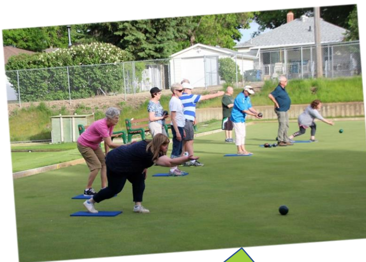
Development camp in the Hat June 4.