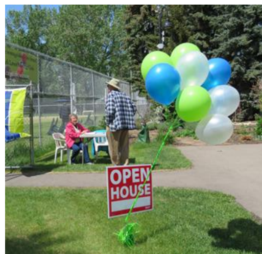
Open House at Stanley Park