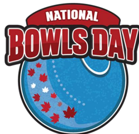
June 8, 2019