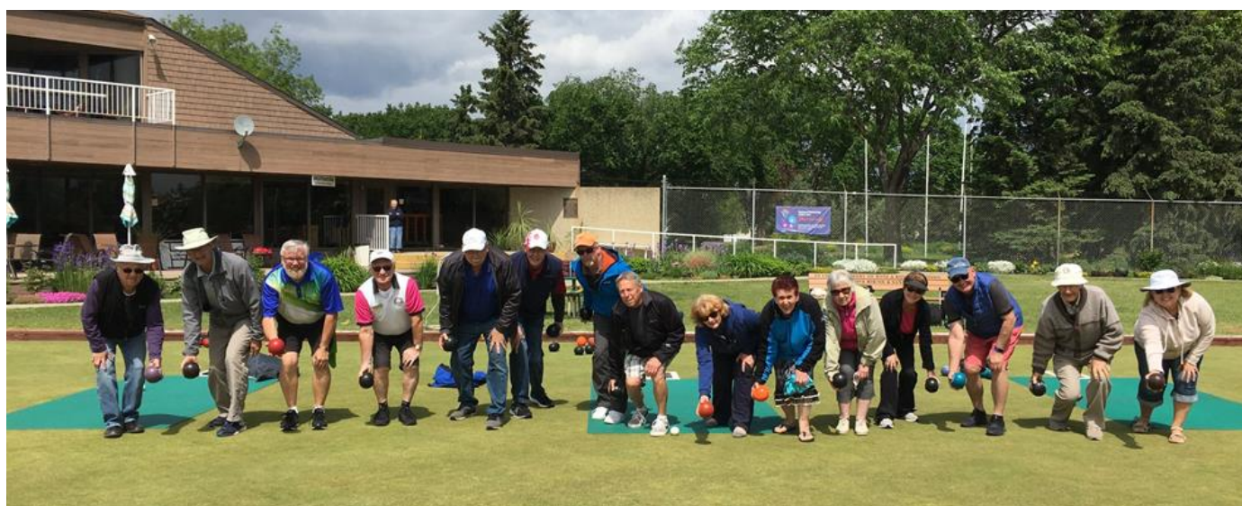
Bowled triples games at the Commonwealth Club with instruction for six 'try-it' drop-in players.