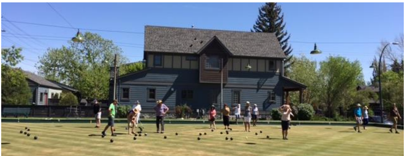
Bow Valley Club pictured above – one of the fastest growing community clubs in 2017.

To grow our sport, the member clubs need to be vibrant and highly visible in their communities. We need to offer them support in meeting the biggest challenges they struggle with. Our association must aim to facilitate increased collaboration among the clubs to ensure they share best practices, support each other in hosting events, and meet their needs of increasing membership. A representative from each member club on the newly formed Marketing & Membership Committee will create an avenue for creating awareness of our sport and increased participation in bowls not only in the neighborhoods of the clubs but across the province.